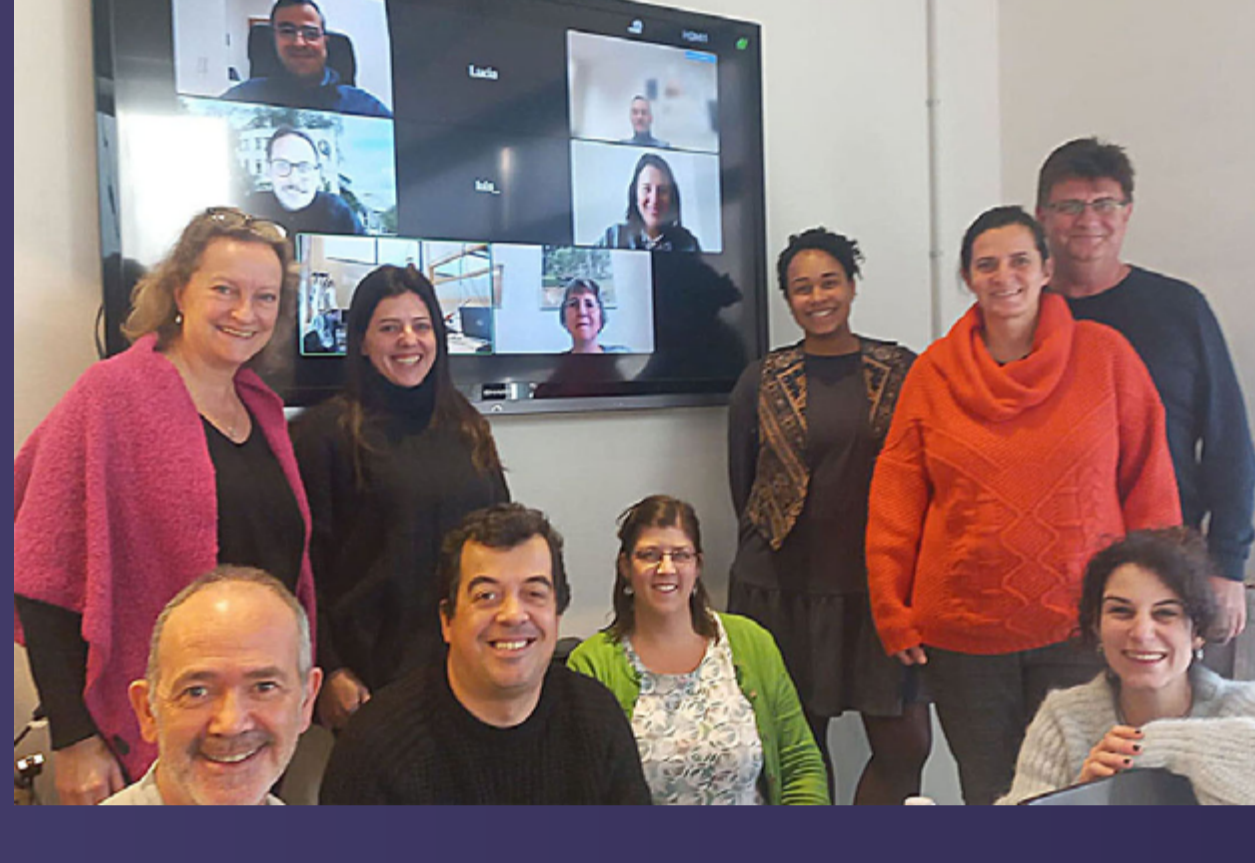
KICK-OFF MEETING, JAN 19-20, 2023

DigitalScouts' project journey started with the Kick-off meeting that was held between January 19 th and 20 th , 2023, in Gouda, The Netherlands. The stage for collaboration continued with the second Transnational Project Meeting , held online between October 23 rd and 24 th , 2023.