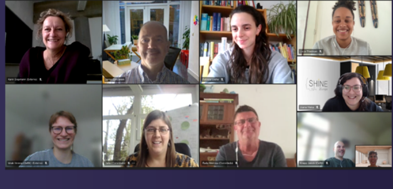
TRANSNATIONAL PROJECT MEETING, OCT 23-24, 2023